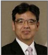
Hiroshi Inomata Japanese Consul General in San Francisco