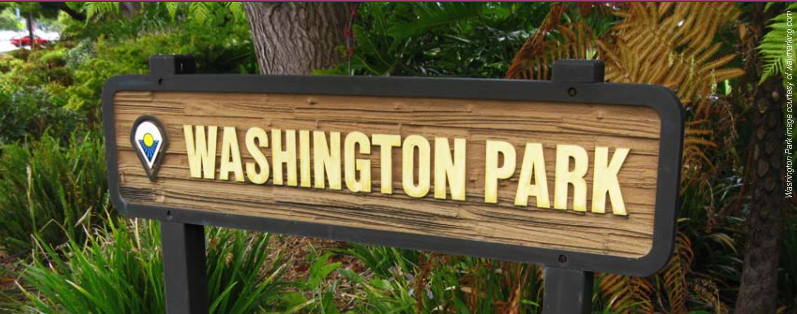
Washington Park

American-Japanese Interaction at the Working Level